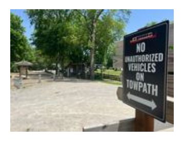
Here at the canal, we want to ensure a safe environment where visitors